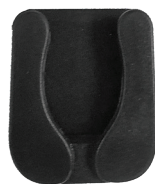
Wall Mount Holder