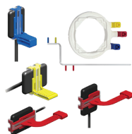
Rinn Positioning Kit