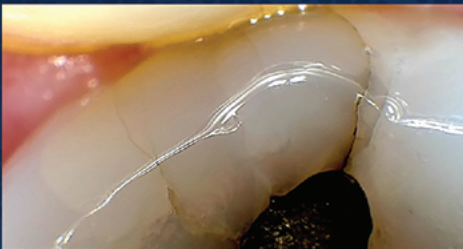
Macro (1/8 - 3/4 tooth)