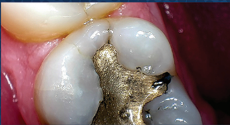
Intraoral (1-4 teeth)